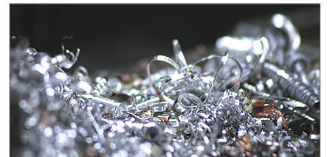
1ST STAGE ENGINEERING

Did you know that we offer first stage engineering services to speed up your processes?