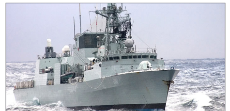
NAVAL & MARINE